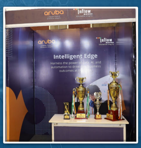
Stall Aruba India | Inflow Technologies