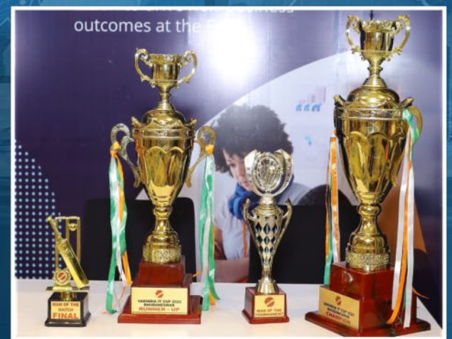
Corporate Cricket League VARINDIA Cup: 13th Cricket Tournament 2023