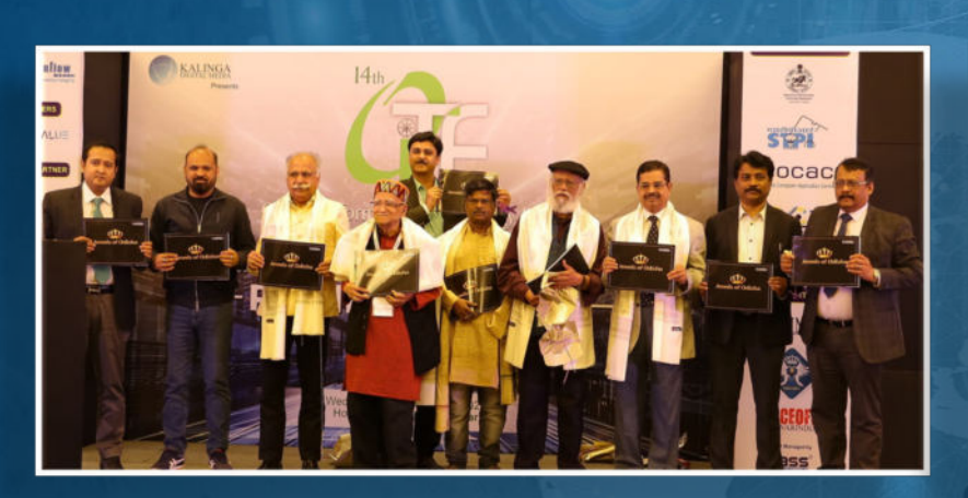
Unveil of JEWELS OF ODISHA Book