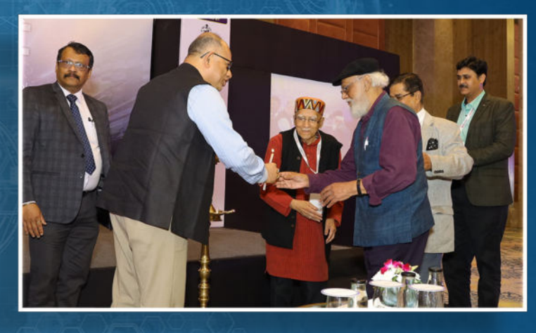
Lamp Lighting Ceremony